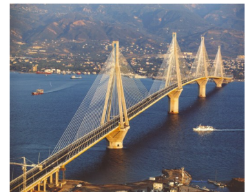
Rio - Antirrio Suspended Bridge, Greece