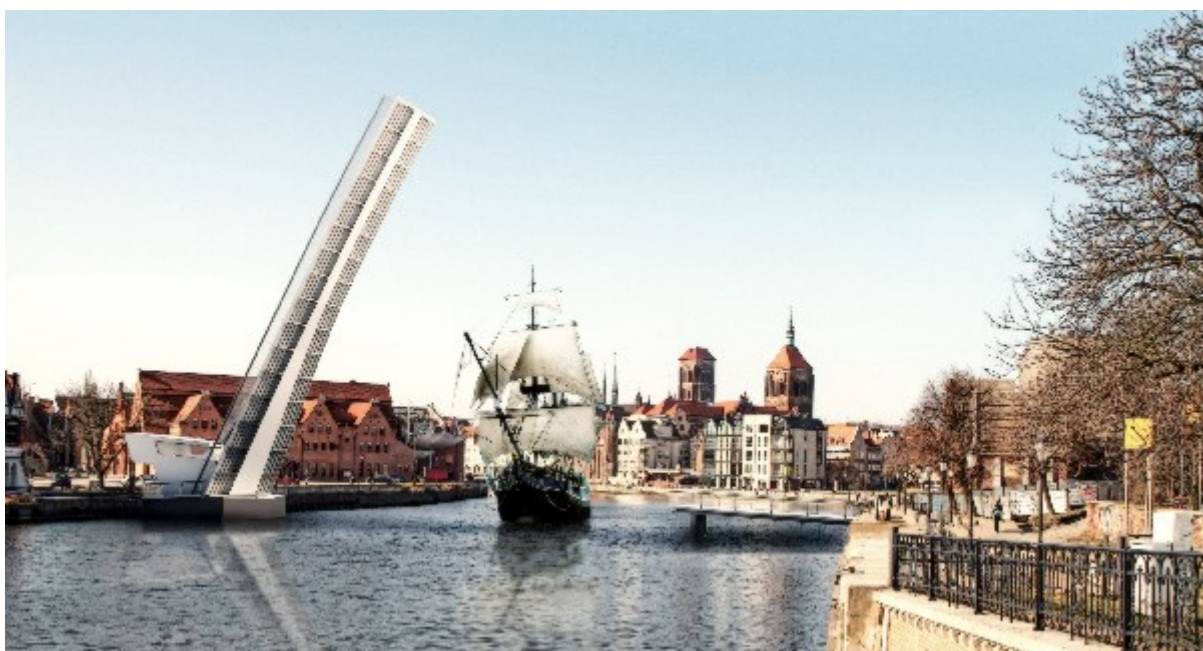
Future Drawbridge over River Motlawa in Gdansk Poland, 1. award in the International Design Competition, designed by Ponting d.o.o., Maribor, Slovenia