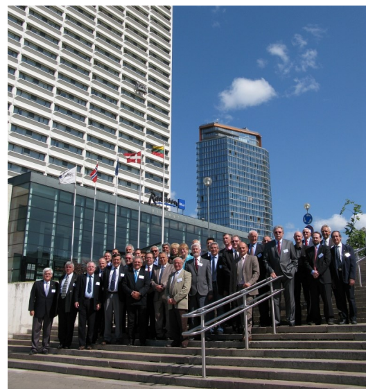
55th ECCE General Assembly Meeting, May 2012, Vilnius, Lithuania