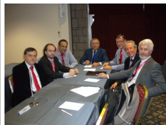
New ECCE ExBo 2012-2014