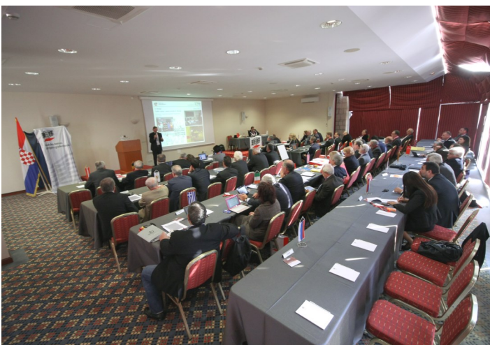
56th ECCE General Assembly Meeting, October 2012, Dubrovnik, Croatia