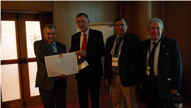
ECCE President awards CICCP.

For further information on the 61 st ECCE General Meeting please visit the link here .