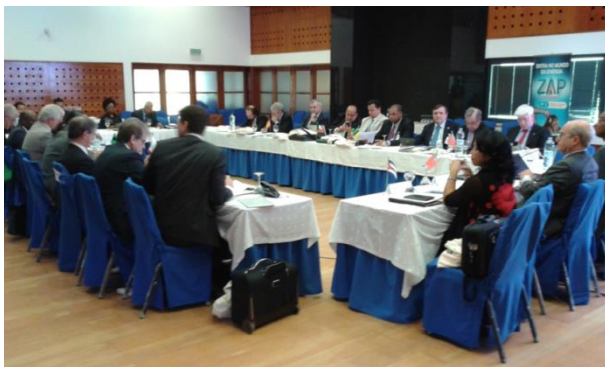
Meeting of the Chambers' Presidents and Invited guests

On the 5 th and 6 th of March 2015, in the capital of Cape Verde, Cidade da Praia met the representatives of the Civil Engineering Chambers from the Portuguese and Spanish speaking countries, including Portugal and Spain, the Latin America Countries, Angola, Mozambique and Cape Verde. Some countries justified their absence like Macau from China.