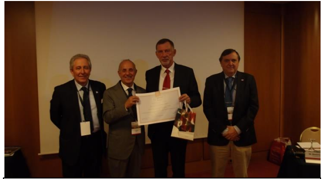
ECCE President awards CNI.