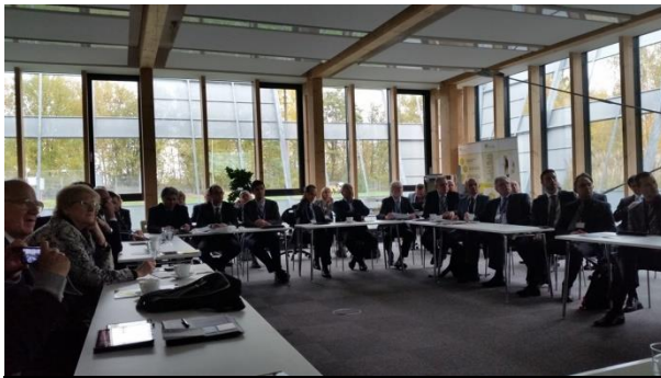
Workshop at UCEEB

The 62 nd ECCE General Meeting – 30 th ECCE Anniversary was held on 30 th – 31 st October 2015, in Prague, in Czech Republic, hosted by the Czech Chamber of Certified Engineers and Technicians (CKAIT). The 62 nd ECCE General Meeting consisted of three parts. The first one was a short workshop that took place on Friday 30 th October at the University Centre for Energy Efficient Buildings ( UCEEB ) organized by the hosts, then it was the regular General Meeting of ECCE and the third part was the celebration