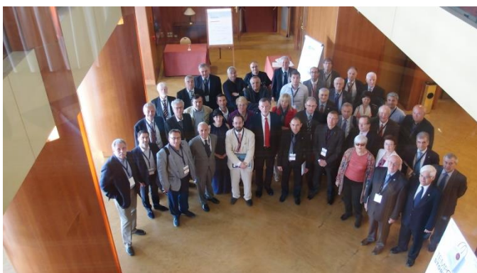
Group photo of the 61 st ECCE General Meeting participants

The 61 st ECCE General Meeting – 30 th ECCE Anniversary was successfully carried out. It was held on 29 th – 30 th May 2015, in Naples, Italy hosted by the National Council of Italian Engineers (CNI).