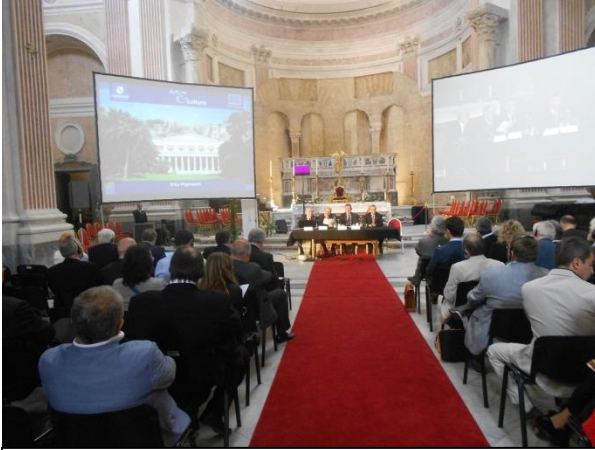
Conference "Artistic and Monumental Heritage – Restoration, Safeguard and Enhancement" at Basilica di San Giovanni Maggiore a Pignatelli