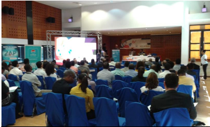
The International Conference

On the second day took place an International Conference with the topics: (I) Infrastructures and Development; (II) Construction in Seismic and Volcanic Zones and (III) The Future of Civil Engineering, with an important audience from Cape Verde engineers.